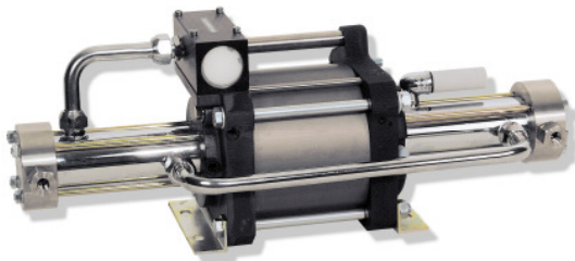
DLE 5-15 single acting, single air drive head two stages