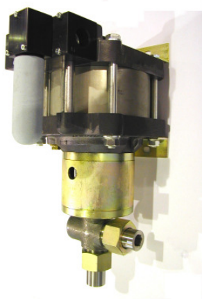
GSF25 (L) single acting, single air drive head with distance piece (Standard= Bottom inlet)